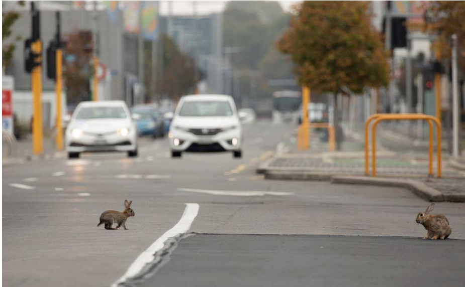
These rabbits crossed a main road in Christchurch on 1st April, during lockdown in New Zealand

The goats of the Welsh seaside spot, Llandudno, normally live on the rocky Great Orme but, on 31st March, the herd was drawn into the quiet town.