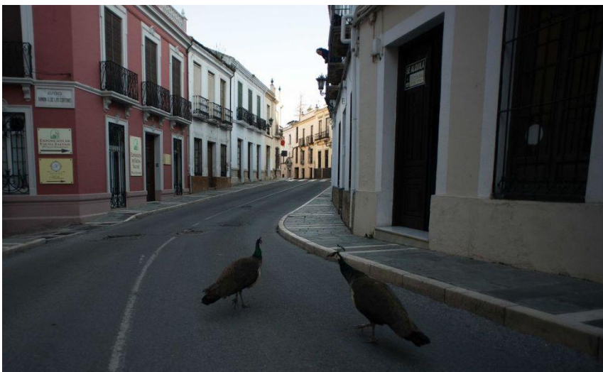
Two peacocks walked down a street in the Spanish city of Ronda on 3rd April, during the national lockdown.